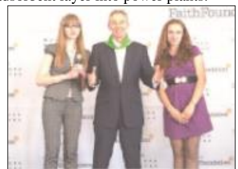
Students of the Faculty with Tony Blair

In the conditions of the energy crisis, the imminent increase in the efficiency of energy use from various sources occurs through the introduction of materials with high absorption capacity, heat transfer and mass transfer in the adsorbent layer into power plants.