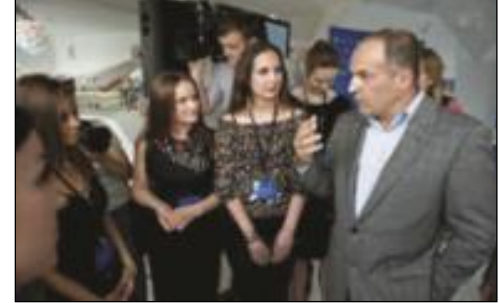
Students of the faculty with a businessman and philanthropist VM Pinchuk

In the conditions of the energy crisis, the imminent increase in the efficiency of energy use from various sources occurs through the introduction of materials with high absorption capacity, heat transfer and mass transfer in the adsorbent layer into power plants.